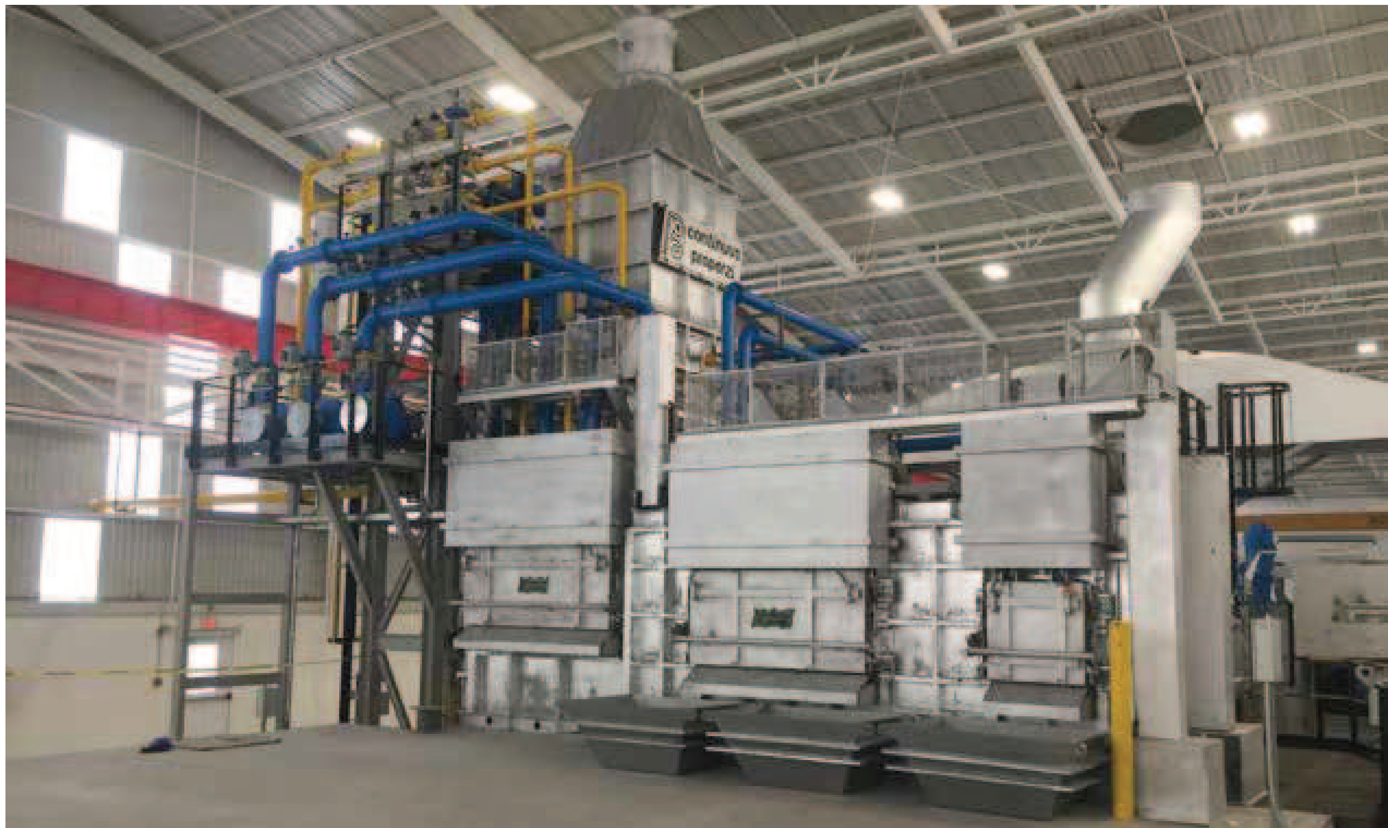
Properzi VertMelt Furnace in operation.