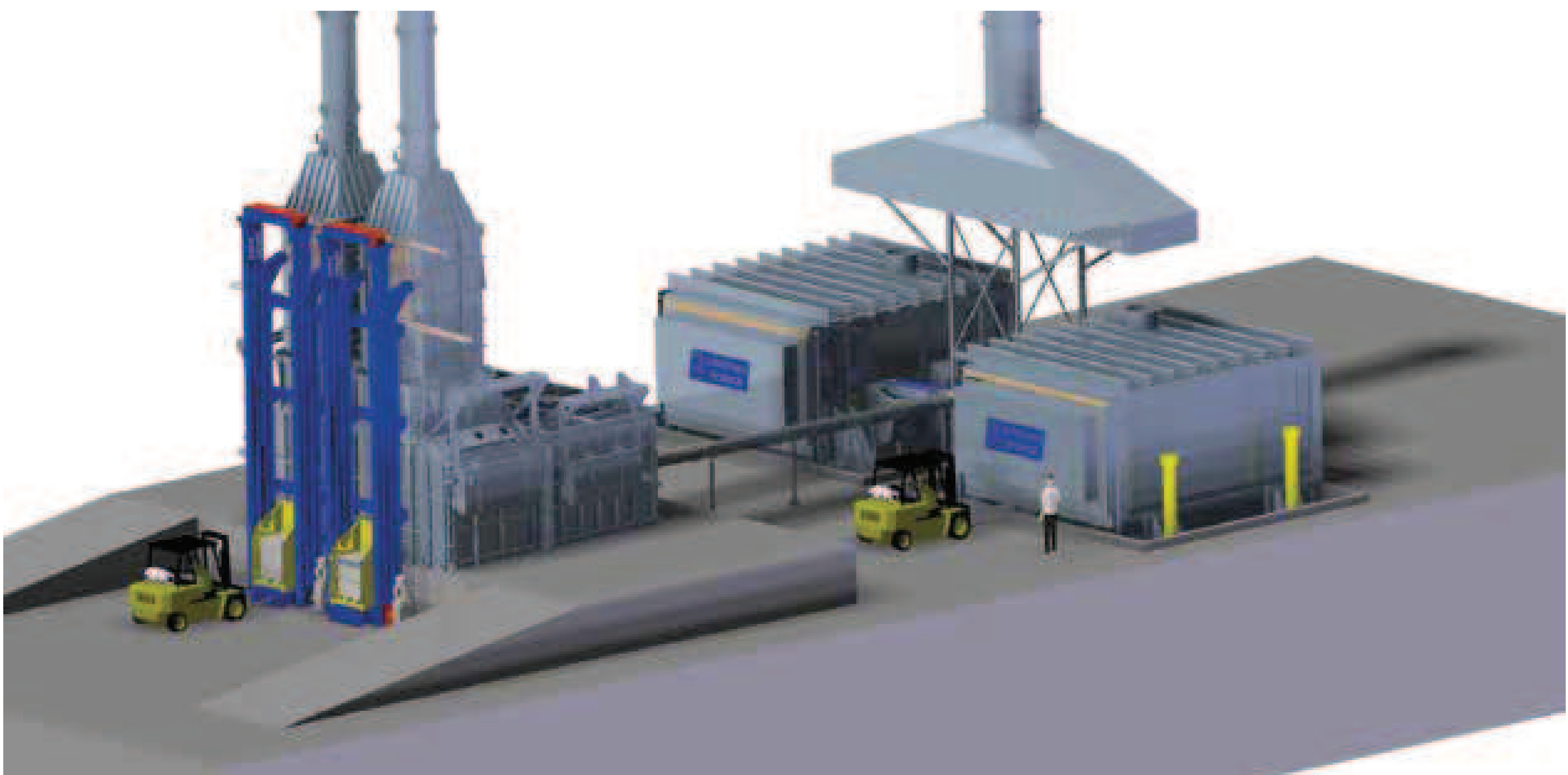
Upper: The basic concept design of Properti VertMelt Furnace; lower: Sketch of the Twin VertMelt 8 tph.