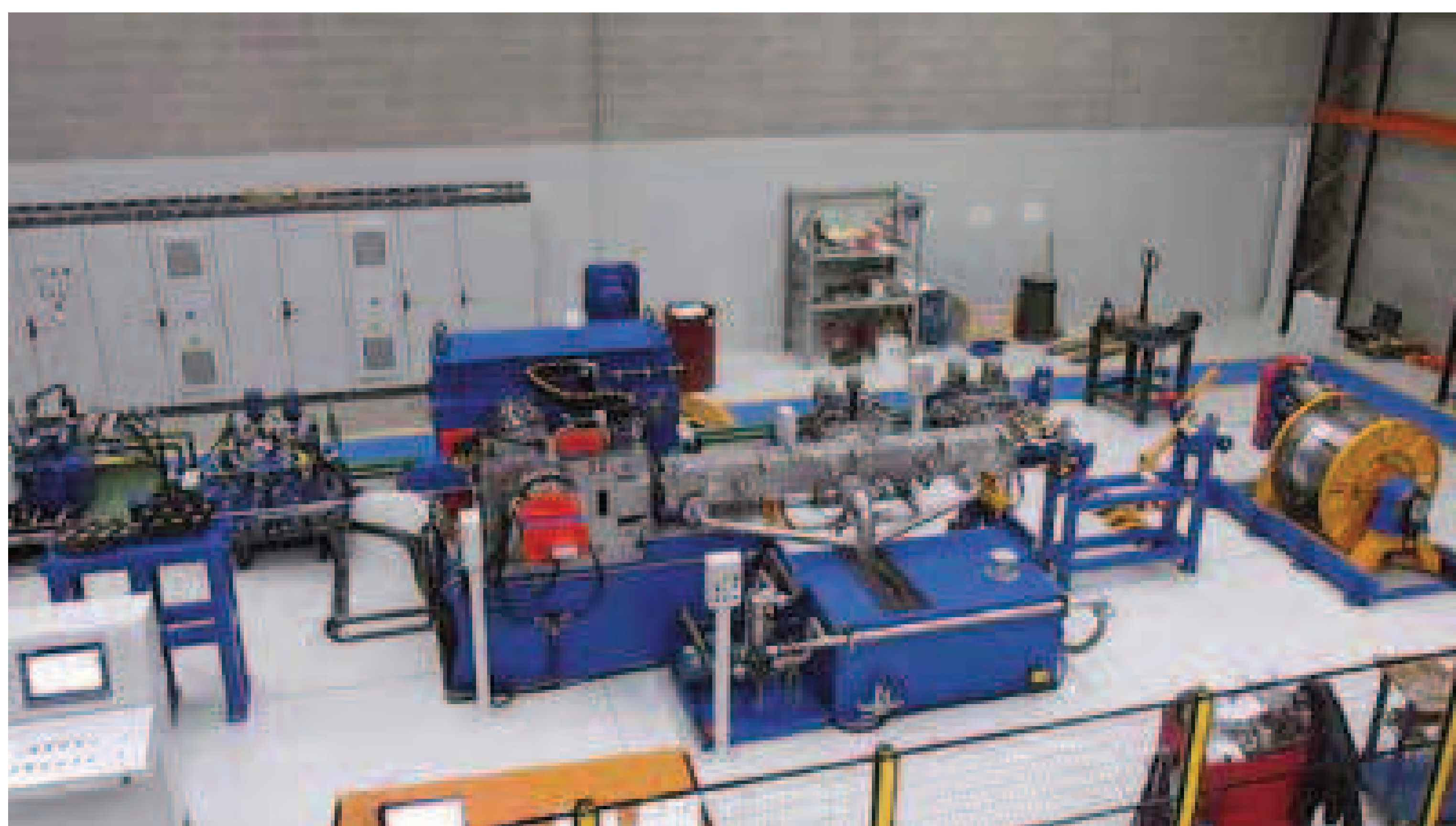
Pro-Form prototype in full operation at Continuus-Properzi headquarters.

The Pro-Form range of machinery will soon include a 500 mm wheel diameter machine.