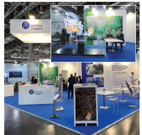
The Properzi Stand. INSET: Clever holographic projection of Properzi logo and products.