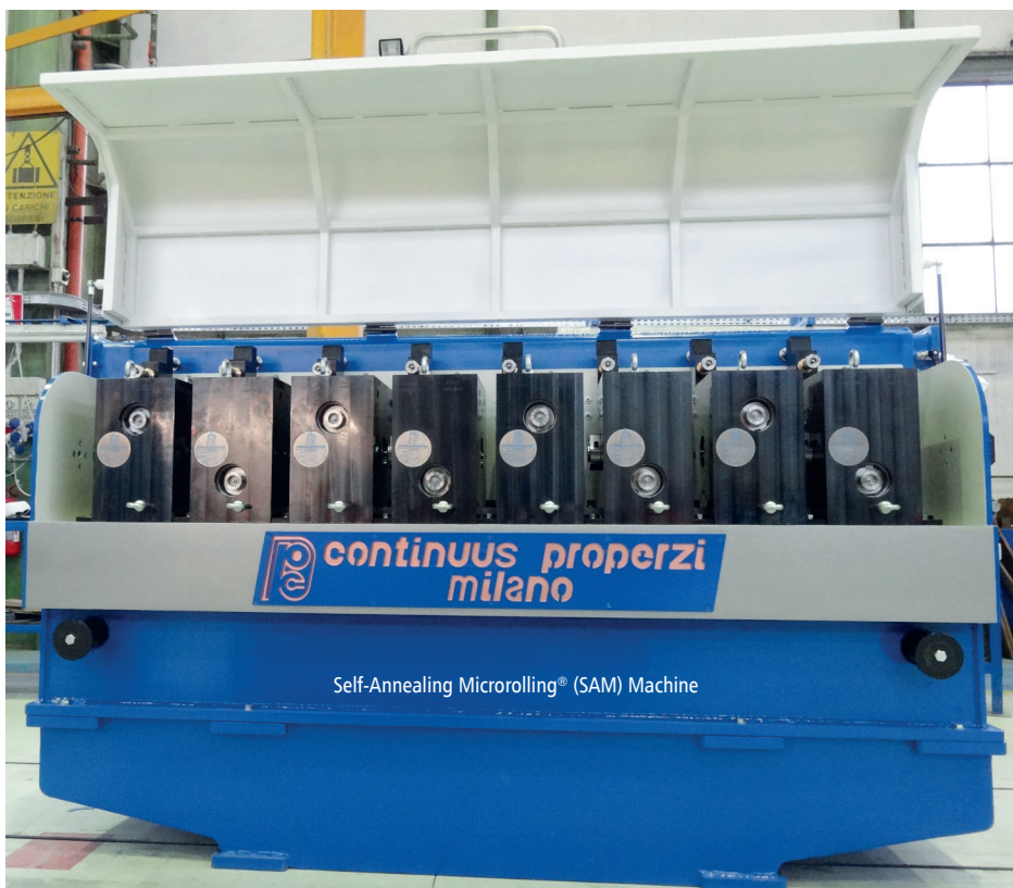
Self-Annealing Microrolling® (SAM) Machine