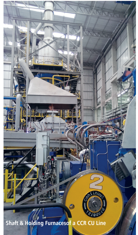
Shaft & Holding Furnaces of a CCR CU Line

Visit us at www.properzi.com or contact sales@properzi.it for more detailed information regarding our complete product offering.