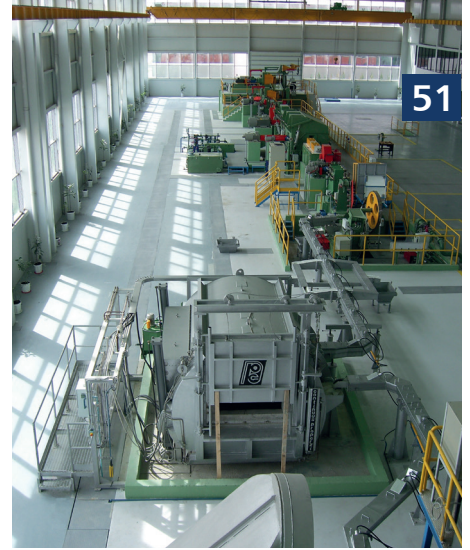
Typical Properti Aluminium CCR Line

The availability of efficient Aftersale Service, which includes on-site technical assistance, remote technical consultancy and the supply of spare parts, is engrained in the corporate culture. Properti is available to supply its equipment on an Engineering, Procurement and Construction (EPC) basis so that the buyer is only minimally involved with the installation of the plant.